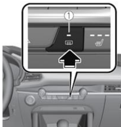
1 Windshield wiper de-icer switch